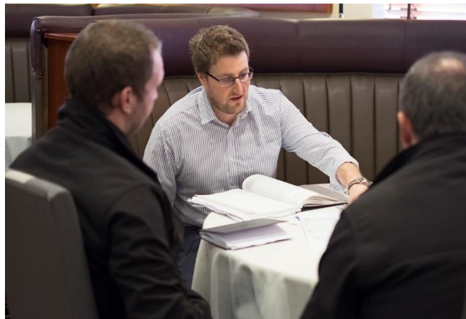
Image: Ysgol Bro Dur and Ysgol Cwm Brombil Meet the Buyer Event

In line with the Council's Well Being Objectives and the National Well Being Goals the following outputs were achieved: